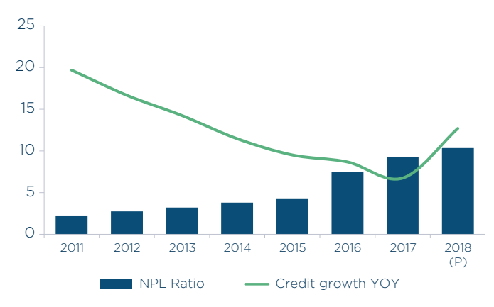
Non performing loans (NPL) and credit growth

Insolvency and Bankruptcy Code: The Government of India implemented the Insolvency and Bankruptcy Code (IBC) to consolidate all laws related to insolvency and bankruptcy and to tackle Non-Performing Assets (NPA) on banks' balance sheets, a problem that has dragged on economic growth for years (Chart 1). Moreover, prior to the introduction of the IBC on May 5, 2016<sup>4</sup>, India's insolvency framework was plagued