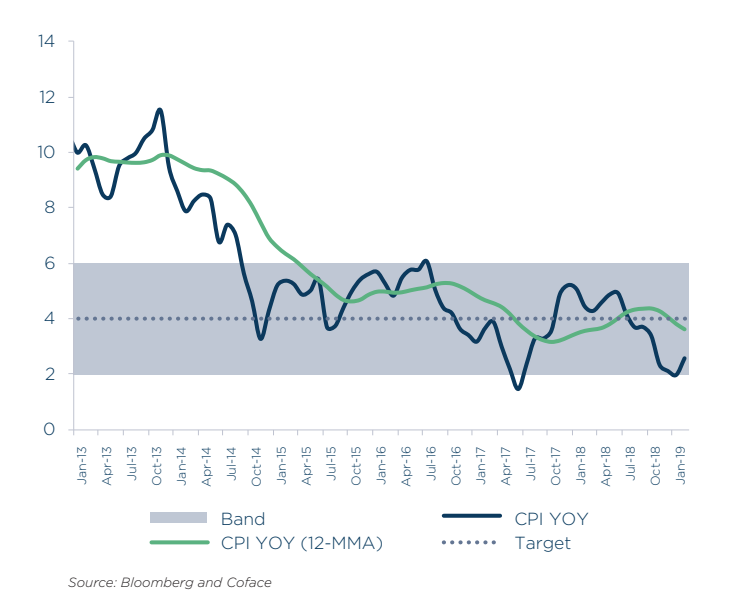
CHART 4: Inflation remains towards the lower end of RBIs target, which should support additional cuts

implement monetary policy easing to alleviate a liquidity squeeze. Heightened scrutiny in the wake of the PNB scandal only served to reduce incentives for banks to lend, interfering with the less-than-optimum monetary policy transmission mechanism and adding to the pressures on the liquidity front. The RBI had a much more stringent stance under the management of Governor Raghuram Rajan and to a lesser extent Governor Urjit Patel. Incumbent Governor Shaktikanta Das has pledged to resolve the issue too, albeit in a much more gradual manner, so as to not upset a fragile domestic balance.