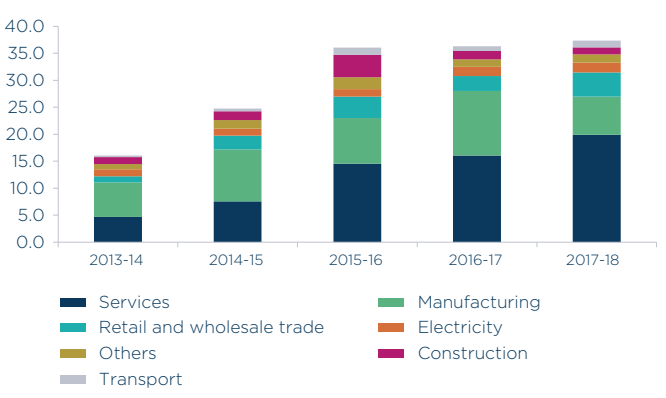
CHART 3: FDI inflows by sector in billions of USD